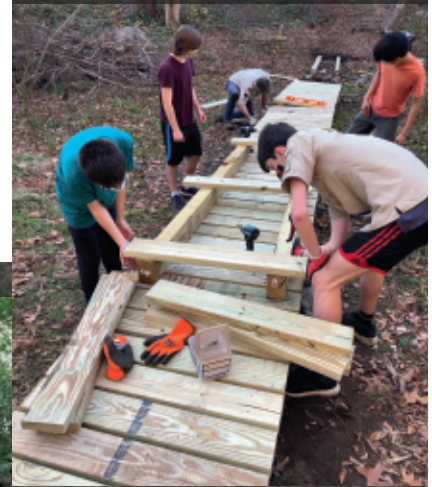
High school volunteers repairing bogwalk