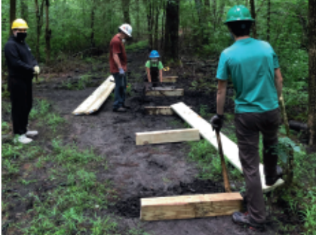
AMC volunteers building bogwalk