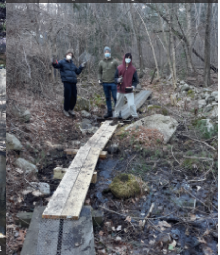
High school volunteers repairing bogwalk