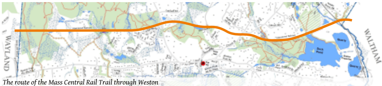
The route of the Mass Central Rail Trail through Weston

All across America organized groups of volunteers help maintain rail trails, run events, create maps and informational material, lead hikes and bike rides, and generally keep things running smoothly. Weston is organizing a "friends" group to do such things for the rail trail, just as Weston Forest and Trail Association does for Weston's current trail network.