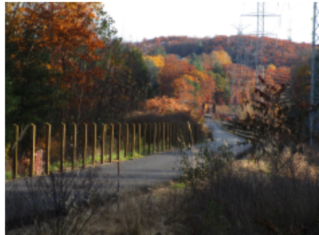
The eastern end of Weston's part of the rail trail, showing the trestle in the distance and fencing in progress, November 2018

To the west this trail continues to Cochituate Road (Route 27) in Wayland, and then past the Wayland Depot and through a historical presentation, being developed, of what was a hundred years ago a bustling major rail yard. Then it crosses Route 20. There are plans to extend it over the Sudbury River and through the National Wildlife Refuge into Sudbury. From there it will eventually go to Hudson, Berlin, and points west as far as Northampton.