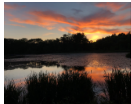
Sunset at College Pond, by Nikolas Tsekeris