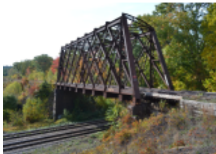
Trestle over the Fitchburg Line

To the east the trail through Waltham to the Belmont border is currently being designed. The route for the Belmont segment has been decided but the trail along it is not yet designed. Eventually the trail will get to North Station in Boston. Going 104 miles between Boston and Northampton, MCRT will be the longest rail trail in Massachusetts.